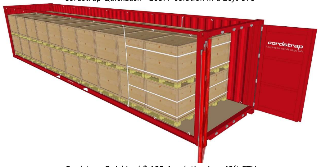
Cordstrap QuickLash® 105.4 solution in a 40ft CTU