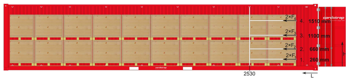
Cordstrap QuickLash® 105.4 solution in 40ft CTU

The principal forces acting in the lashings, on the lashing/anchor points and on the cargo is presented in the figure below.