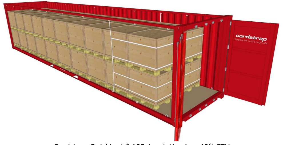
Cordstrap QuickLash® 105.4 solution in a 40ft CTU