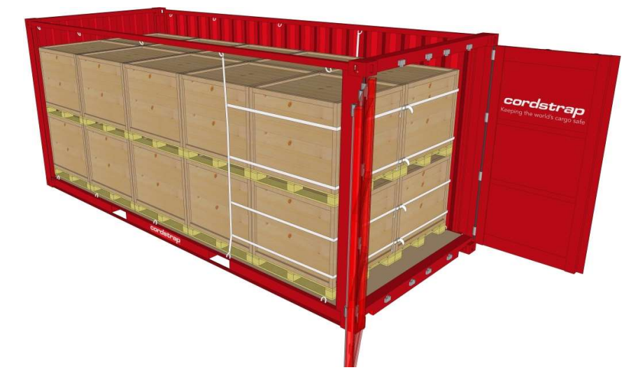
Cordstrap QuickLash® 105.4 solution in a 20ft CTU

Appendix CS202002-A to MariTerm AB Certificate CS202002