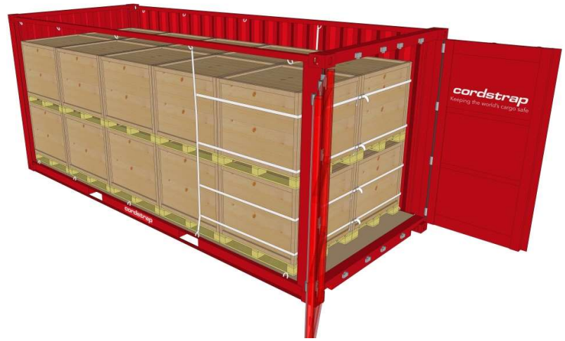
Cordstrap QuickLash® 105.4 solution in a 20ft CTU

Addendum CS202002-L to MariTerm certificate CS202002