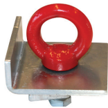
Reefer Lashing Point

ANCHORLASH® CAN BE USED IN A REEFER CONTAINER WITH A REEFER LASHING POINT