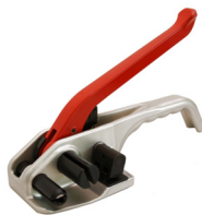
Manual Tensioner CT40 (2)