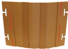
FlexBoards (Drums and BigBags)