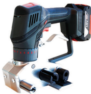
Battery Tensioner CBT35

USE THE RECOMMENDED TOOLS TO ENABLE EASY, FAST AND CONSISTENT APPLICATION.