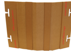
FlexBoards (Drums and BigBags)

USE THE RECOMMENDED TOOLS TO ENABLE EASY, FAST AND CONSISTENT APPLICATION.