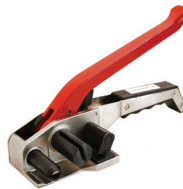
Manual Tensioner CT40 (2)