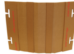
FlexBoards (Drums and BigBags)

USE THE RECOMMENDED TOOLS TO ENABLE EASY, FAST AND CONSISTENT APPLICATION.